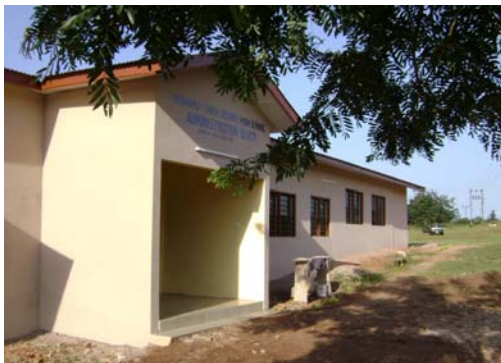
Above right: Grand Opening by Ghana's Minister of Communication on October 6th. Above left: the newly completed Administration block